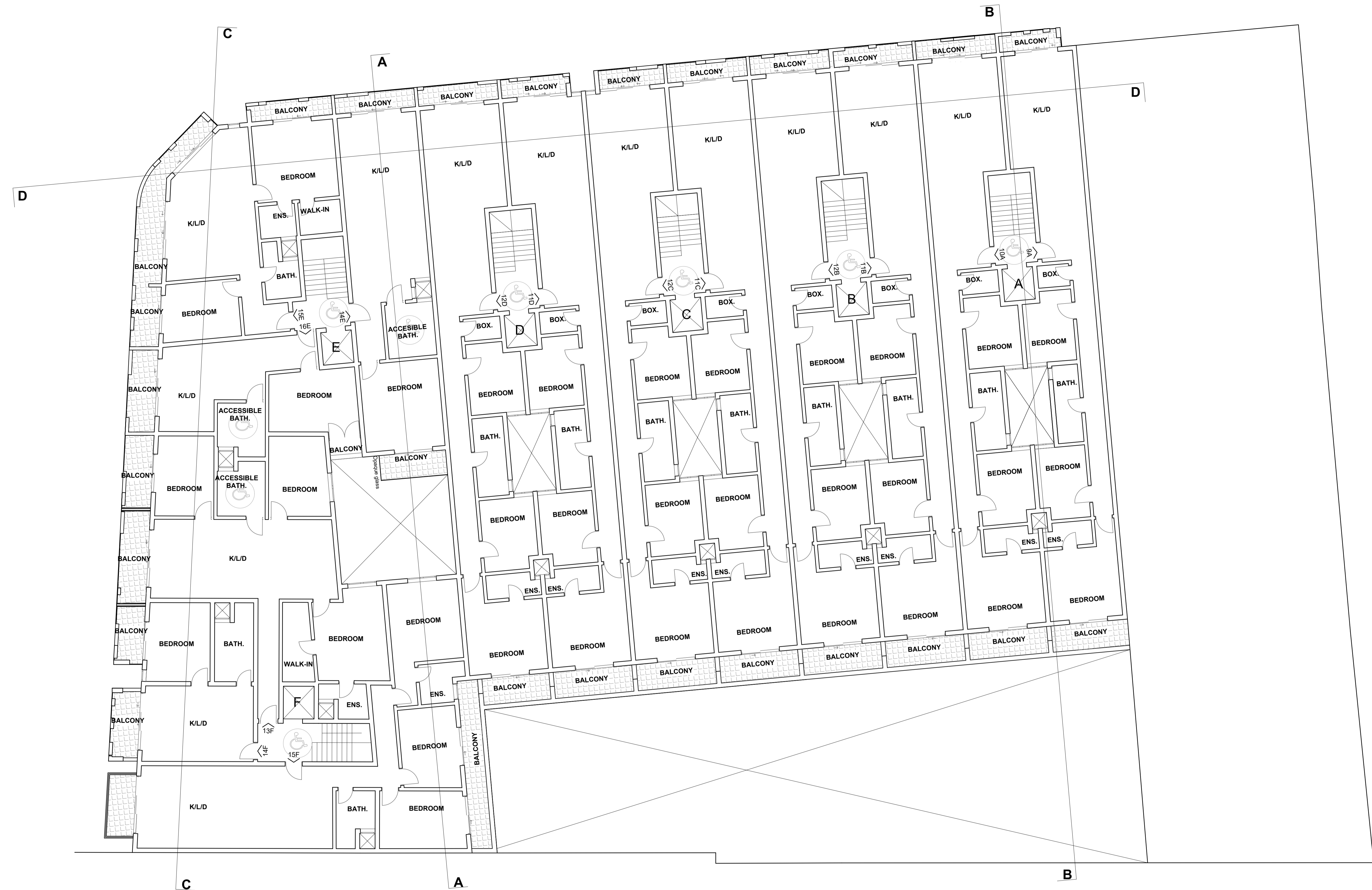
As built level 5 Scale 1:100