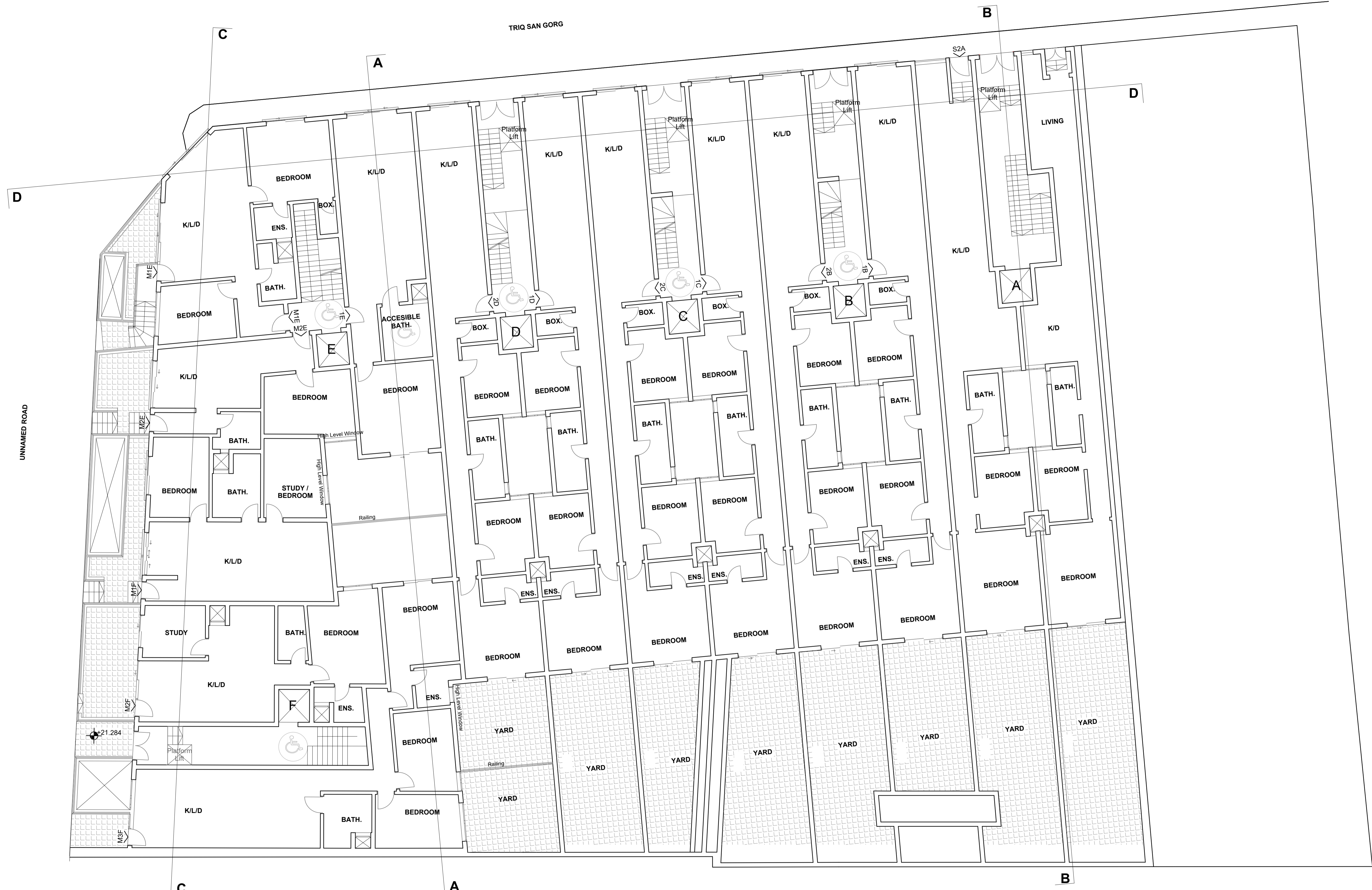
As built Level 0 Scale 1:100